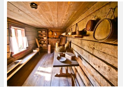
Seurasaari Open-air Museum 90 min

Helsinki and Seurasaari Private Shore Excursion