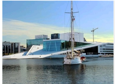
Oslo Opera House

Oslo cathedral is a very old church, dating to the 17th century .It is used for the state events and the special occasions for the Norwegian Royal Family like the wedding of Haakon, Crown Prince of Norway, and Mette-Marit Tjessem Høiby in 2001.