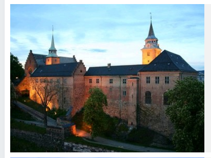
Akershus Castle and Fortress

Highlights Oslo by Walk & Public Transport