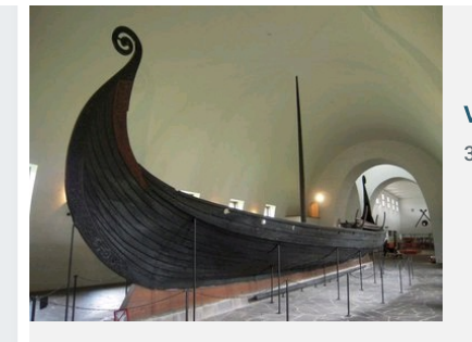
Viking Ship Museum 30 min