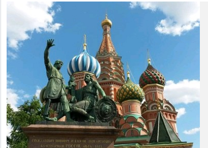
St. Basil's Cathedral 10 min

Private Moscow Highlights on FRI-WED for 3-DAY Cruisers