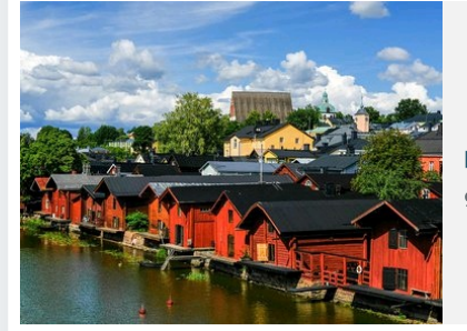
Porvoo Village 90 min

Helsinki and Old Town Porvoo Join-in Shore Excursion