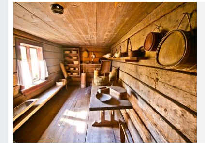
Seurasaari Open-air Museum 90 min

Helsinki and Seurasaari Private Shore Excursion