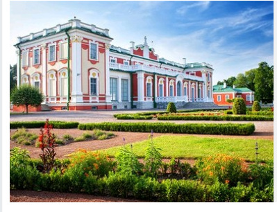
Kadriorg Palace and Park 20 min

The Dome Church is one of the oldest churches of Tallinn. The church looks very simple with the white walls and small dome, but it has the very long history. It was first mentioned in 1233 and since than it has been one of town's main temples. It's dedicated to Virgin Mary.