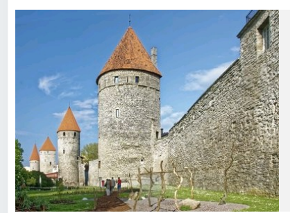
City walls of the Old Town 10 min

Tallinn Old Town and Viking Village Adventure