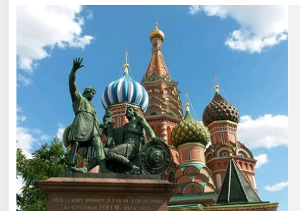
St. Basil's Cathedral 10 min

Private Moscow Highlights on THU for 3-DAY Cruisers