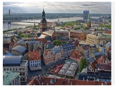
Old Town of Riga

The current castle was the Livonian order residence; it is currently occupied by the president of Latvia. The castle is an impressive structure with white walls, fat towers, and a red roof. Currently the castle is closed for renovation after the 2013 fire.