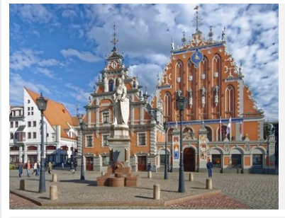
House of the Blackheads

Old Town of Riga is famous for its cathedrals, old buildings, churches. Take a walk through the labyrinth of the narrow streets, enjoy the colorful buildings, little shops, and sweet restaurants. A photo stop at the famous Dome square and cathedral, Castle with the Castle square, Town Hall, house of the Blackheads is an absolute must.