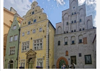
The Three Brothers

Riga Old Town and Central Market Highlights