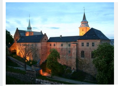
Akershus Castle and Fortress

Oslo Accessible Tour: Vigeland Park & Viking Ship Museum