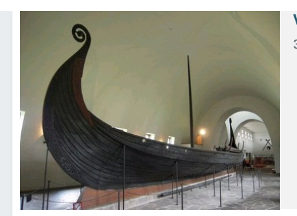
Viking Ship Museum 30 min

The Viking Ship Museum houses archaeological finds from different areas of Scandinavia. The main attractions are the Oseberg ship, Gokstad ship and Tune ship. Additionally, the Viking Age display includes sledges, beds, a horse cart, wood carving, tent components, buckets and other grave goods.