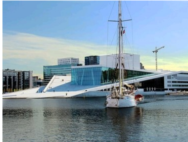
Oslo Opera House

Oslo cathedral is a very old church, dating to the 17th century .It is used for the state events and the special occasions for the Norwegian Royal Family like the wedding of Haakon, Crown Prince of Norway, and Mette-Marit Tjessem Høiby in 2001.