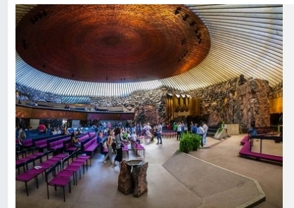
Rock Church 25 min

Helsinki Private Walking Shore Excursion