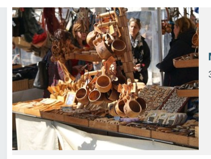
Market Square 30 min